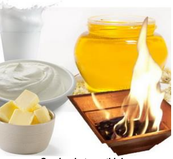
One is what one thinks. (As you think so you become.)

They have been pointed in the right direction (Dharma). However, they can still be corrupted when they interact much with negative people.